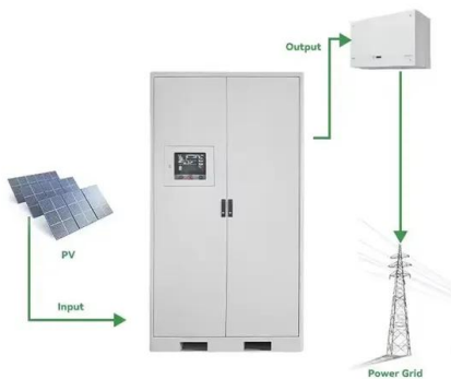
ABB central inverters PVS800 - 500 to 1000

The MEGATRON 1MW Battery Energy Storage System (AC Coupled) is an essential component and a critical supporting technology for smart grid and renewable energy (wind and solar). The MEG-1000 ...